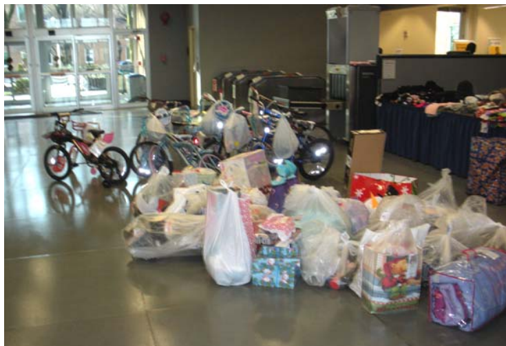
Just half of the wonderful gifts collected at DOE Germantown. This is what generosity looks like.

ERWA would like to thank our DOE family for participating in the Salvation Army's Angel Tree Program. At the Germantown facility, the ERWA shop and a spare room were filled with gifts that will make 120 local children smile and have a wonderful Holiday. And we are sure our Angels from the Forrestal collection will also benefit from the thoughtfulness of our employees and contractors.