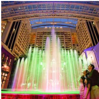
The Brightest Star Fountain Show will play nightly.

For discounted tickets: www.ChristmasOnThePotomac.com . (use code RGLUN9) and save $6.50 off adult tickets and $3.00 on children's tickets (not valid Friday-Sunday).