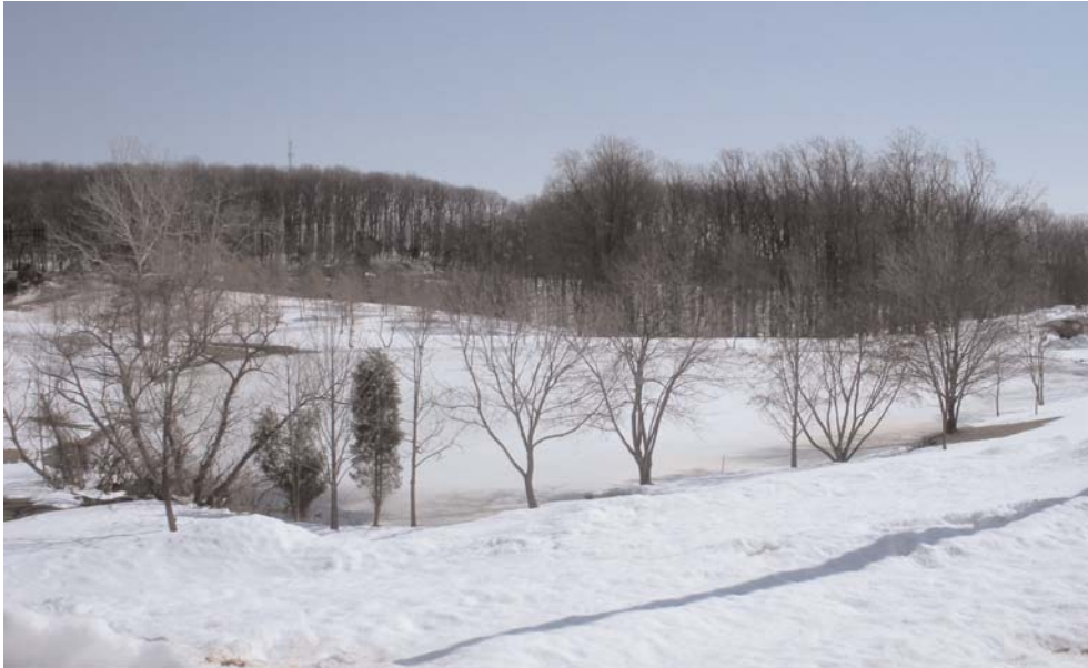
Overlooking the pond at the DOE Germantown campus. The only thing missing are the deer who reside in the woods.